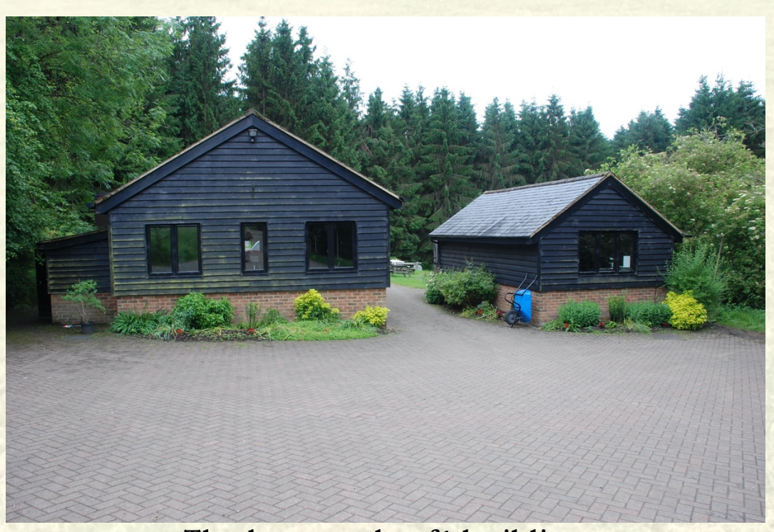
The barn and café building