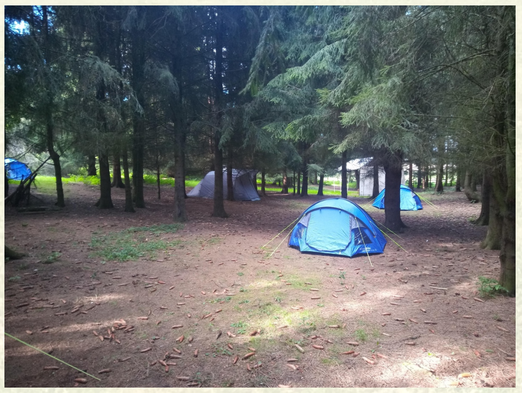
Tents camped in the woods