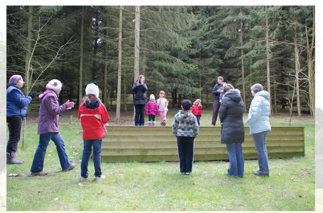
The stage in the woods