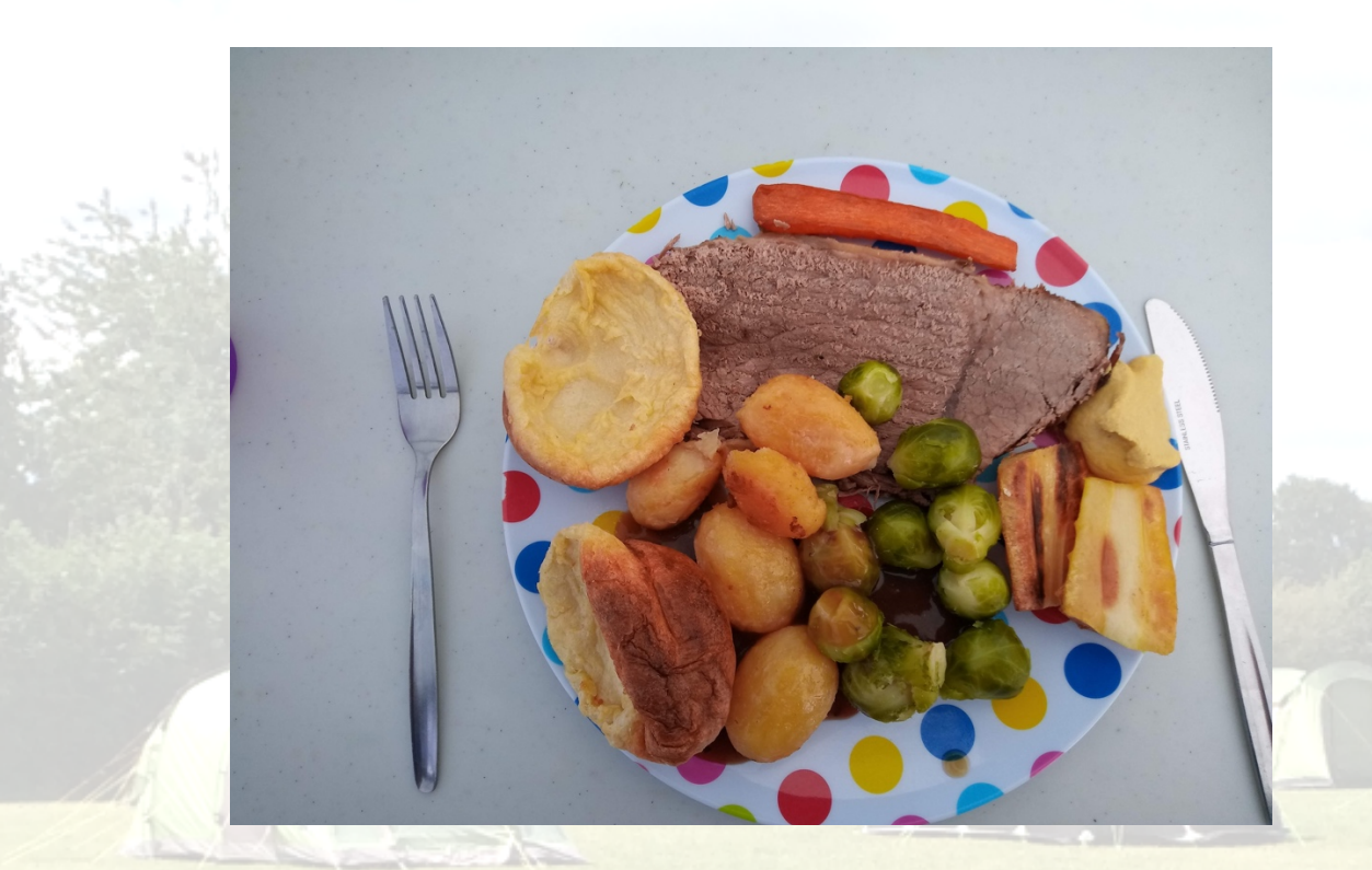
Examples of dinners we cook