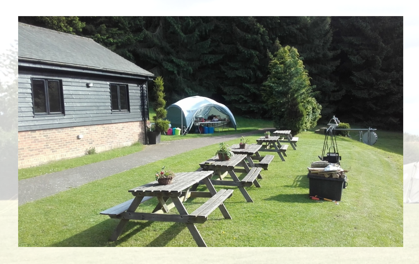
The main communal area with barn in background