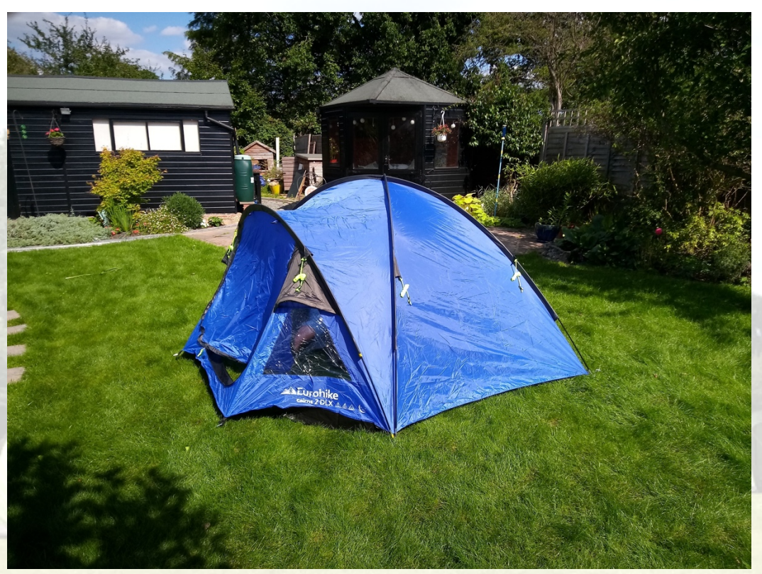
The tents students use