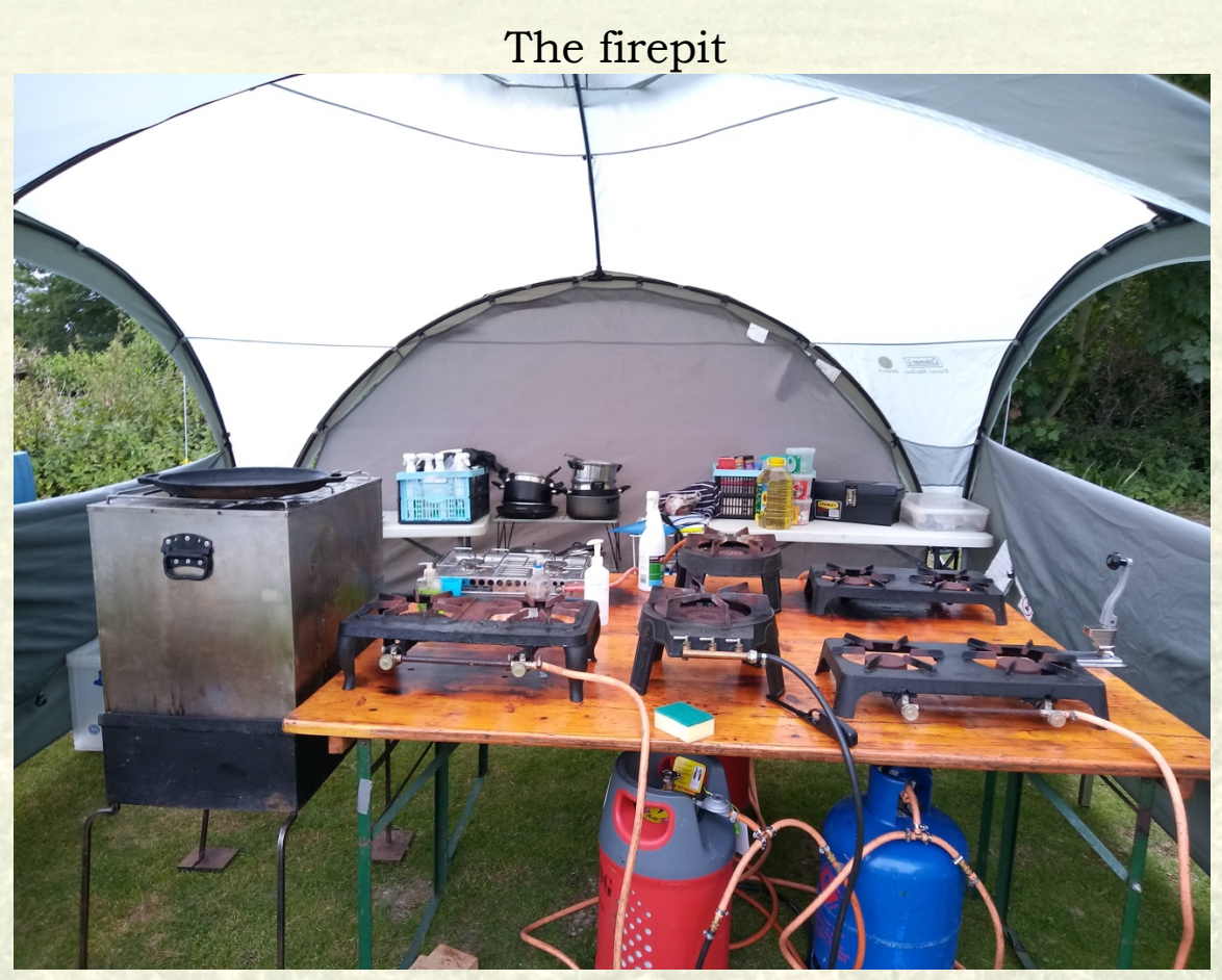
The Outdoor Group Kitchen